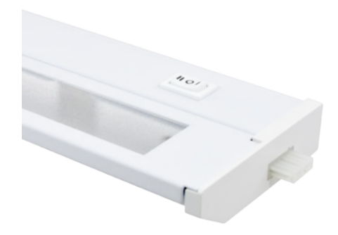
Priori Xenon - Dark Bronze